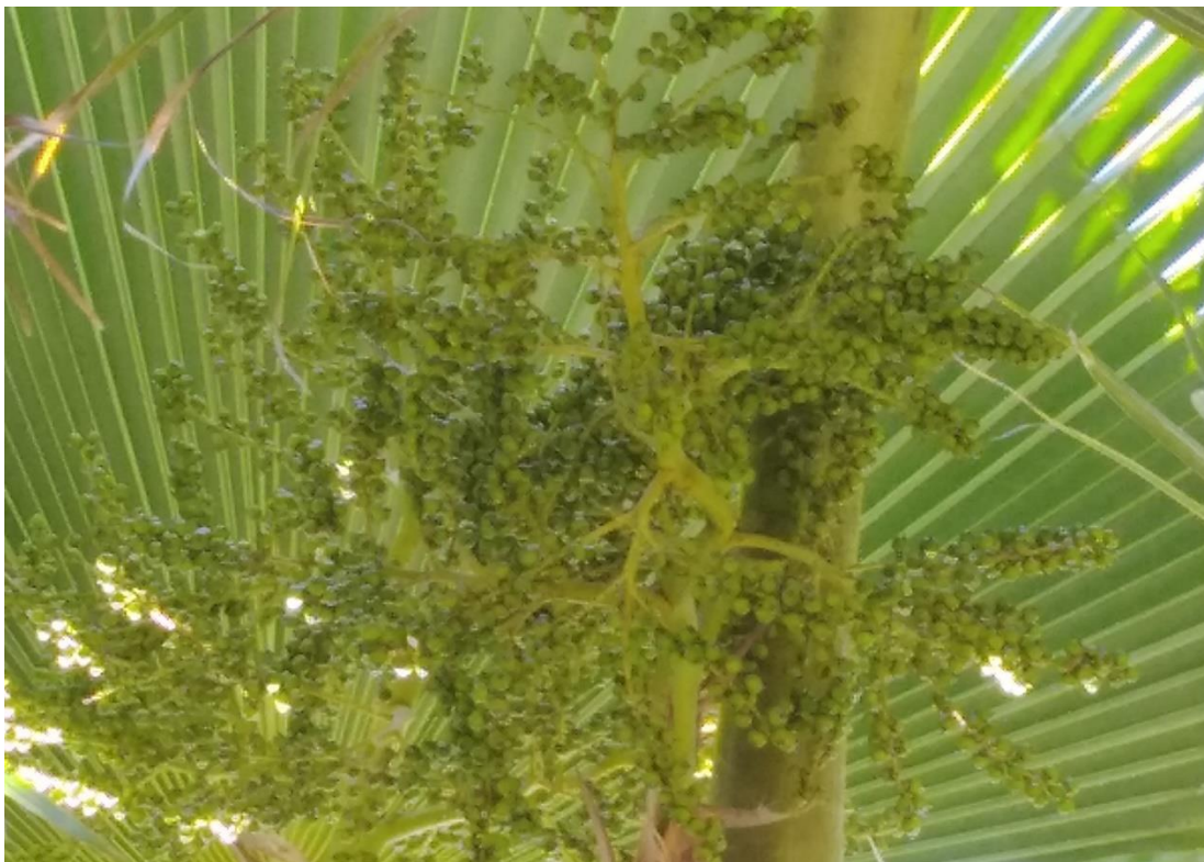
Image 1. Showing Iniao fruits, which become dark as they mature.

According to “The Flora of the Cook Islands” (Sykes, 2016), the Iniao is a small tree ranging in size from 4 to 6m in height, with a trunk diameter of around 35cm, when mature. Other authors suggest that the tree can grow up to 10m in height (Hodel, 2007). The crown of the tree has up to 25 fan shaped fronds and produces fruits of between 5 and 7mm in diameter that become dark brown or black (Sykes, 2016). It has a smooth trunk, moderate to dark gray, with a slight bulge in the middle. It emits a hollow, resonating, drum-like sound when knocked on (Hodel, 2007). Underneath these trees there is a thick layer of dead, fallen leaves from the palms (Hodel, 2007). The pictures below show some of the features of the Iniao